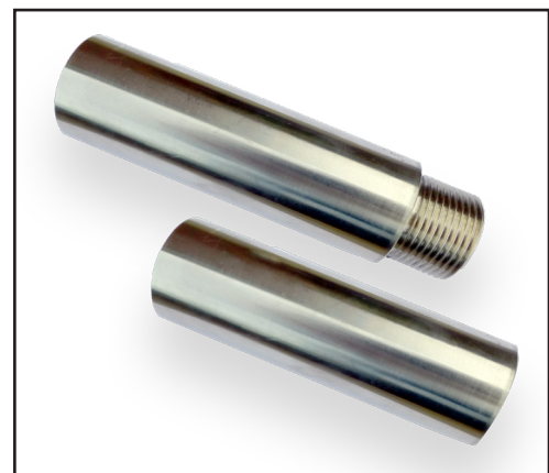
Drive-in adaptors, pictured above, with 1" BSPM thread or plain ended can be used to connect to drill rods.

Dynamic pore pressure monitoring (Strain Gauge version only)